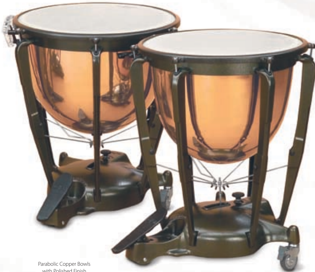
Parabolic Copper Bowls with Polished Finish