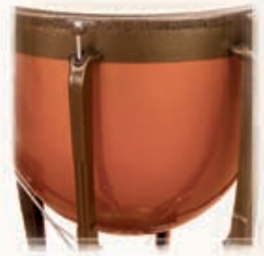
Parabolic Fiberglass Bowl