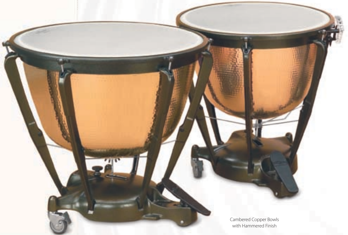
Cambered Copper Bowls with Hammered Finish